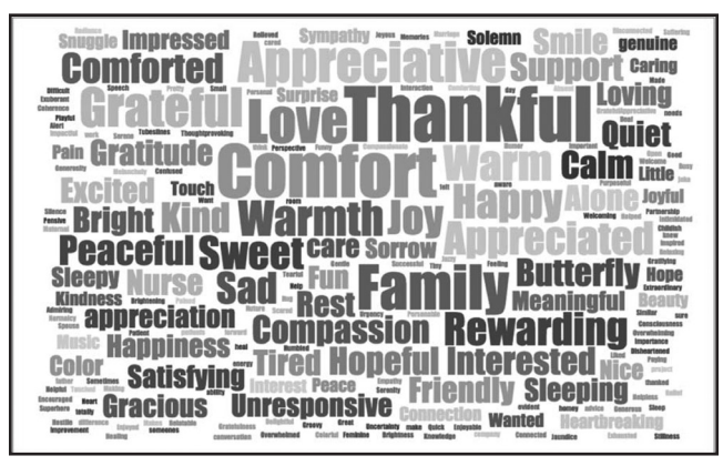
Figure 1. Word cloud showing nursing students' Three Words task responses.

interdisciplinary team meetings of the palliative care consult service, gift handcrafted shawls to patients receiving palliative care, and participate in extracurricular events focused on palliative care, attitudes toward death and dying, and engagement with the local community. The handcrafted shawls are made by volunteers, including community volunteers, alumni, and nursing students. One example of an extracurricular activity students participate in is joining a crafting circle with volunteers who donate shawls to the project. Along with nurses, physicians, social workers, and others on the palliative care team, students identified patients and families who might like to receive a shawl. During the gifting process, students document thoughts and feelings about their experience. Unlike clinical rotations, the main objective when gifting shawls is to engage in communication and experience forming a caring relationship with the patient and family. Students participating in the year-long Comfort Shawl Project report that they feel much better prepared to care for dying patients during their first year of professional practice (Glover et al., 2017). The aim of the study was to more formally analyze nursing students' experiential learning as they gifted comfort shawls.